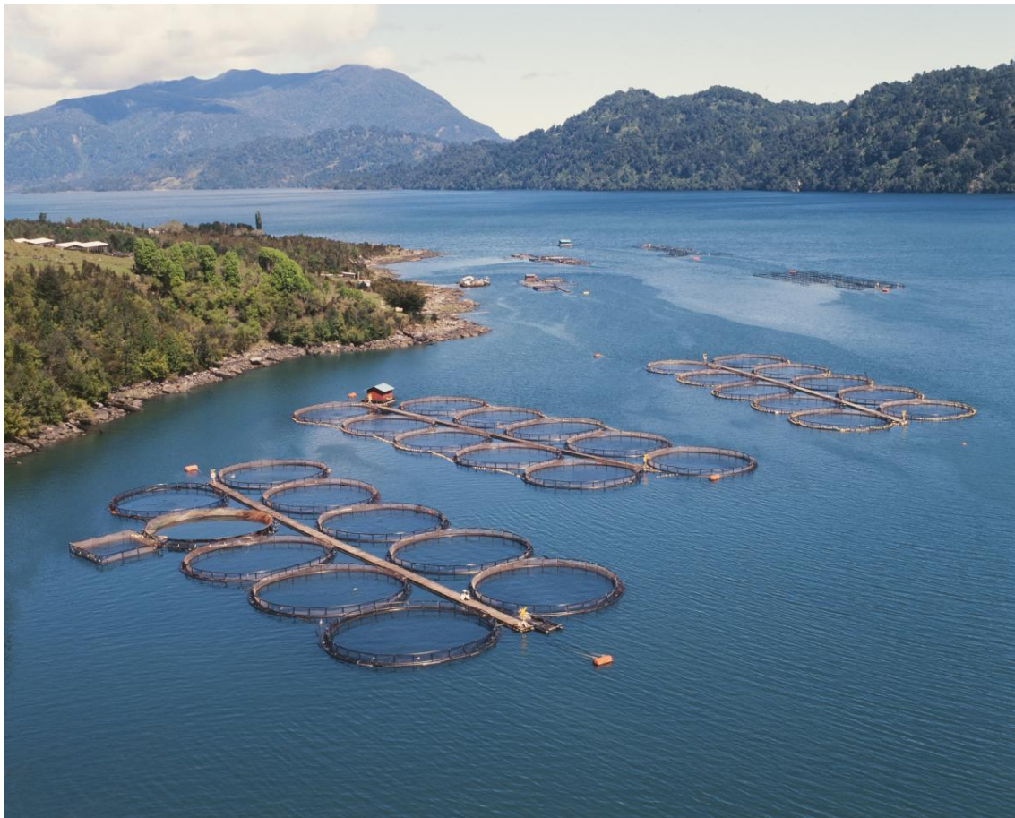
Salmon aquaculture, Bahía Ralún, Chile.